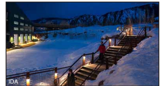
IDA This fully shielded lighting improves visibility while preserving the stars.

Effective lighting that helps people be safe, not just feel safe, is a win-win situation for everyone. You can create a safer environment while keeping the night natural.