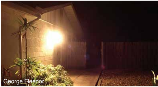
George Fleenor The glare creates deep shadows.

Light for the sake of light does not equal safety. Bright, glaring lights that illuminate some nighttime events and locations can diminish ambiance, but did you know that they can decrease security as well? Overly bright lighting creates a sharp contrast between light and darkness, making the places outside the area of illumination nearly impossible to see. Bad lighting can even attract criminals by creating deep shadows that offer concealment.