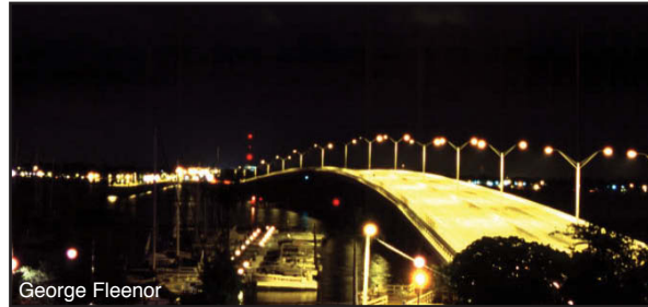
George Fleenor Lighting using fully shielded fixtures reduces glare and expense.

Lights that cause confusion or visual distraction can be deadly while driving. Erratically spaced roadway lights decrease the ability to see a pedestrian or other roadway obstruction. Street lights with noticeable source luminescence, or glare, cause distraction instead of guidance to the driver. Illuminated signs and flashing lights from commercial establishments offer another challenge to concentration. Many cities have enacted bylaws restricting or limiting the use of such devices to improve traffic safety.