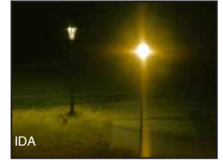
IDA The shielding keeps light on the ground where it is needed.

Lights left on from dusk to dawn provide no alert activity. Installing a motion sensor, or turning off lights and forcing a trespasser to use a flashlight attracts more attention, which is emerging as a more effective way to prohibit property damage.