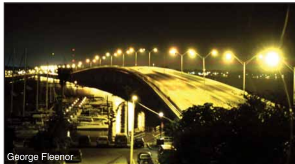
George Fleenor Lighting using drop down glass or plastic lenses can cause unsafe glare.

Lights that cause confusion or visual distraction can be deadly while driving. Erratically spaced roadway lights decrease the ability to see a pedestrian or other roadway obstruction. Street lights with noticeable source luminescence, or glare, cause distraction instead of guidance to the driver. Illuminated signs and flashing lights from commercial establishments offer another challenge to concentration. Many cities have enacted bylaws restricting or limiting the use of such devices to improve traffic safety.