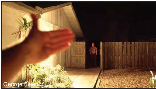
George Fleenor The glare from the light hid a possible attacker.

Light for the sake of light does not equal safety. Bright, glaring lights that illuminate some nighttime events and locations can diminish ambiance, but did you know that they can decrease security as well? Overly bright lighting creates a sharp contrast between light and darkness, making the places outside the area of illumination nearly impossible to see. Bad lighting can even attract criminals by creating deep shadows that offer concealment.